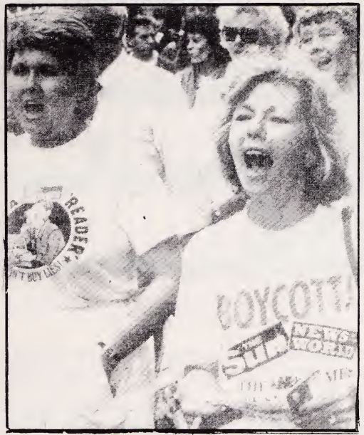
THE SUN NEVER SHINES ANYMORE

Murdoch's rejecting latest offer the sacked News International strikers signal their determination to fight on for full reinstatement and entry into the Wapping print plant.